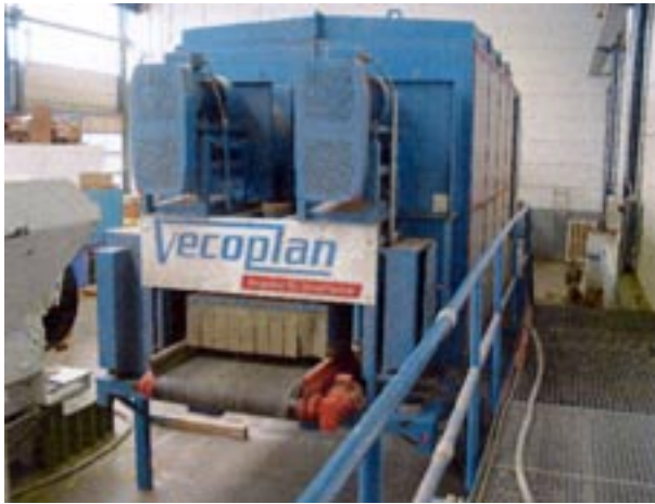
Installation on a standard demountable body, semi-mobile

For the separation of low density fraction out of pre-shred production waste, mixed construction waste, plastic waste from the pulper as well as municipal and industrial waste. The final product is a high calorific fuel which can be re-shred and pelletised.